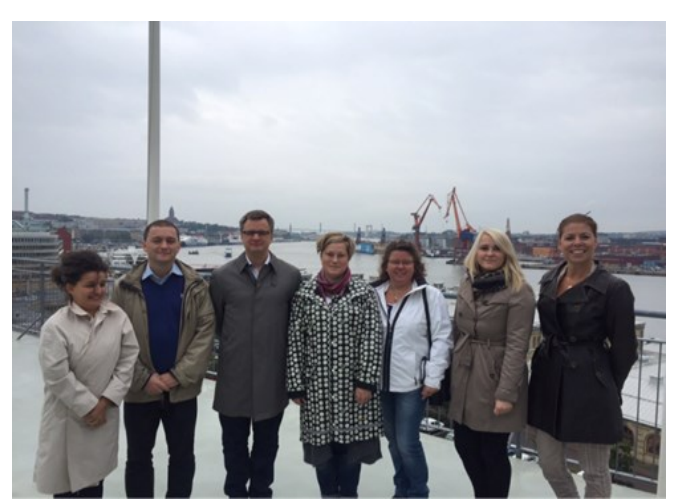
Project partners from Latvia, Sweden and Poland.

Project SEBCO (Social enterprises in partnership with the business community) aims to build knowledge and confidence in social enterprises, and to find methods to make social entrepreneurship visible as a vital sector of society. This project also compares how partnerships between social enterprises and the business community at large operate in the different partner countries and looks at the success factors.